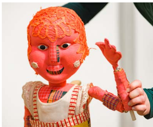
• Little Red