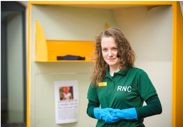
• Doctor Student