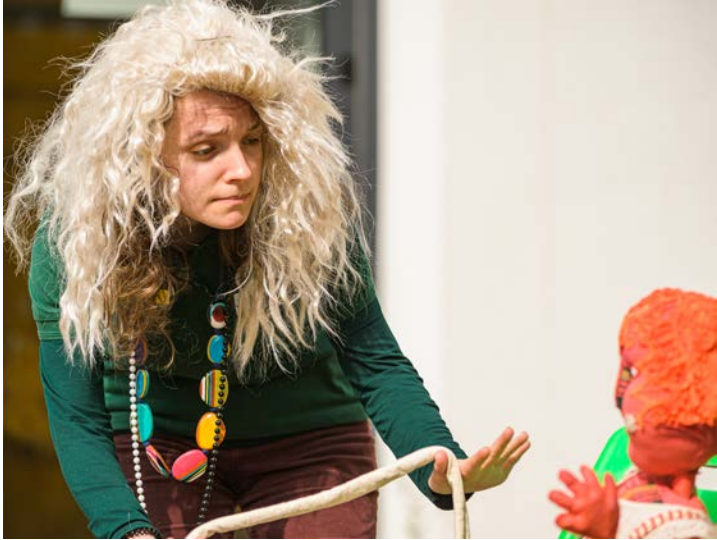
• Busy Body

Sometimes Nikki and Robyn play different characters: